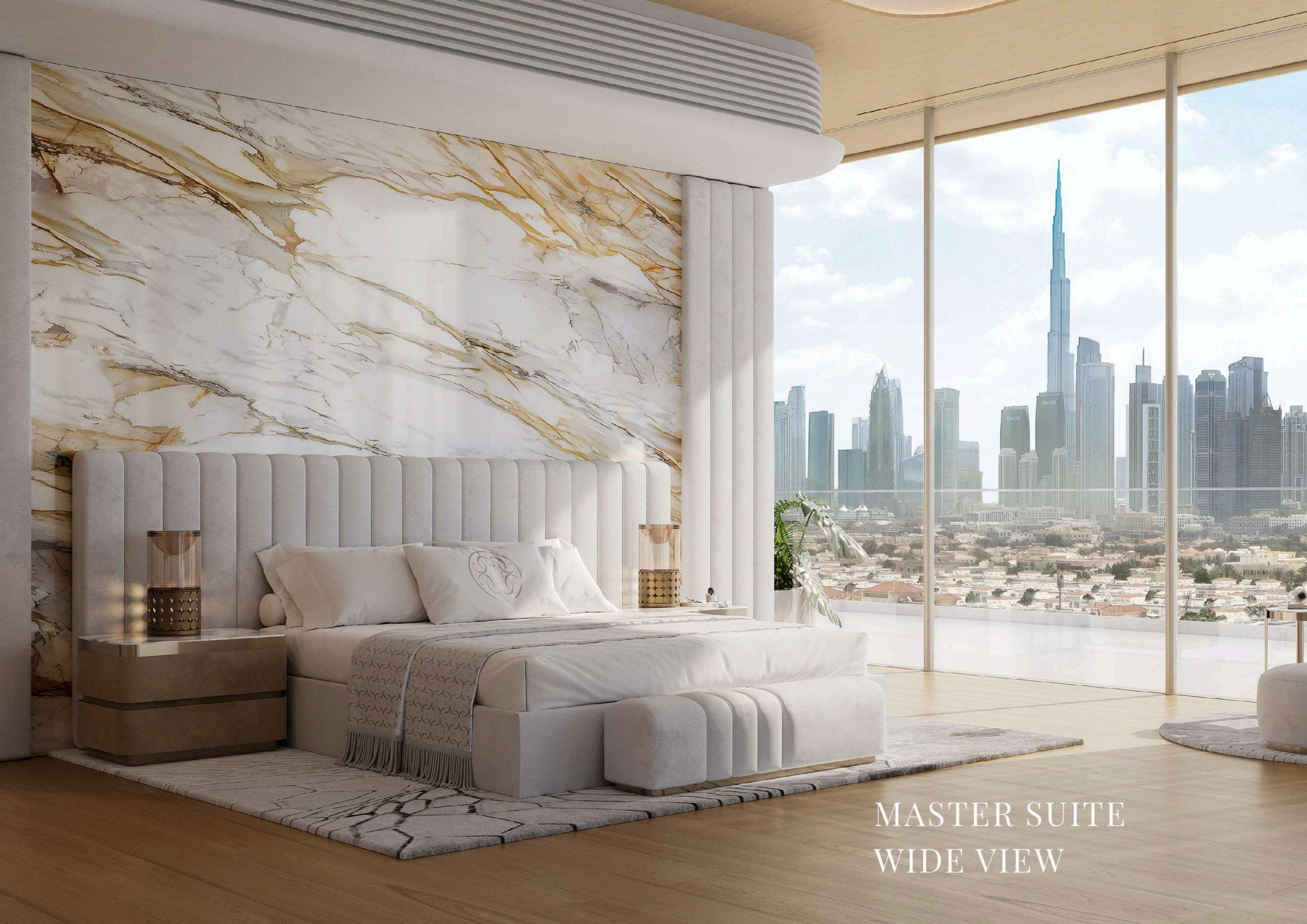
MASTER SUITE WIDE VIEW