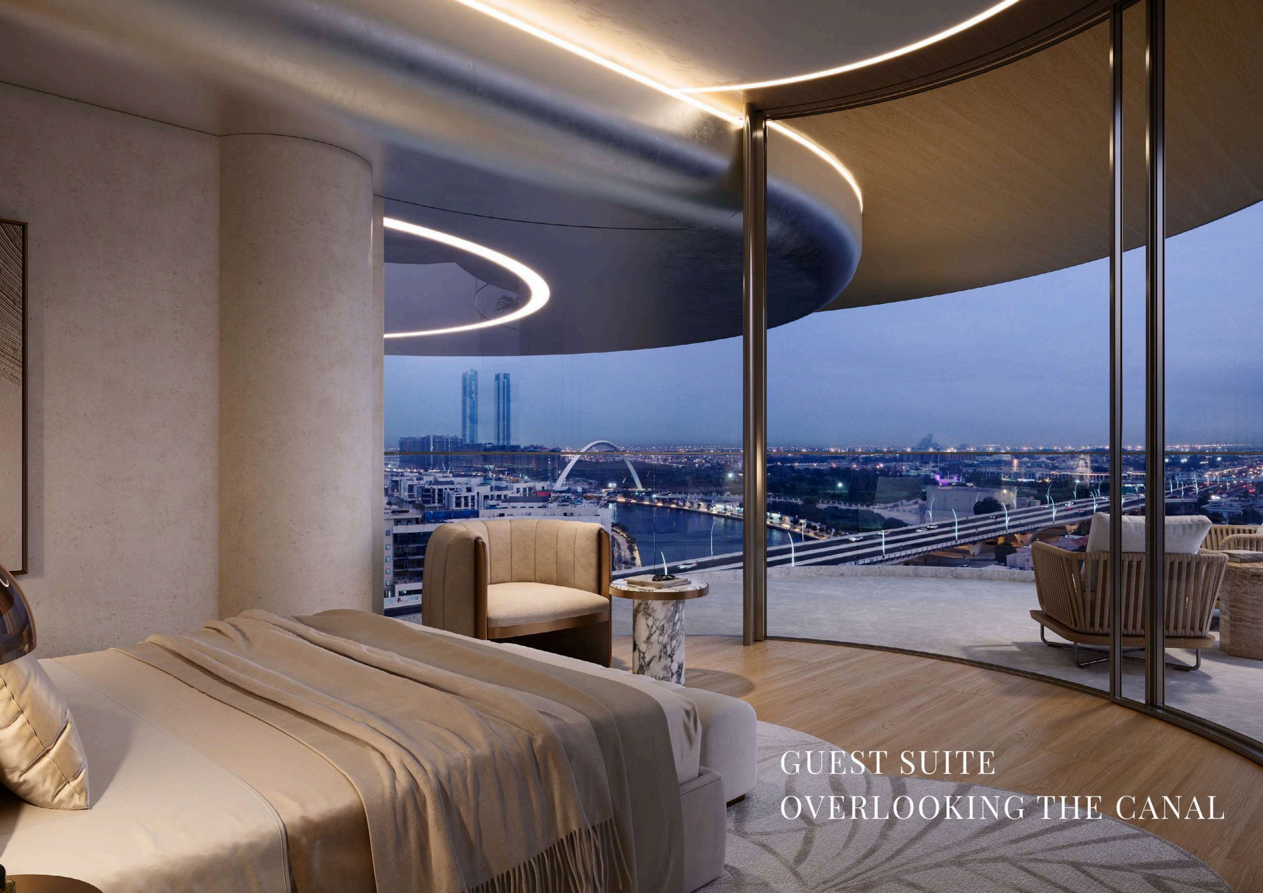
GUEST SUITE OVERLOOKING THE CANAL