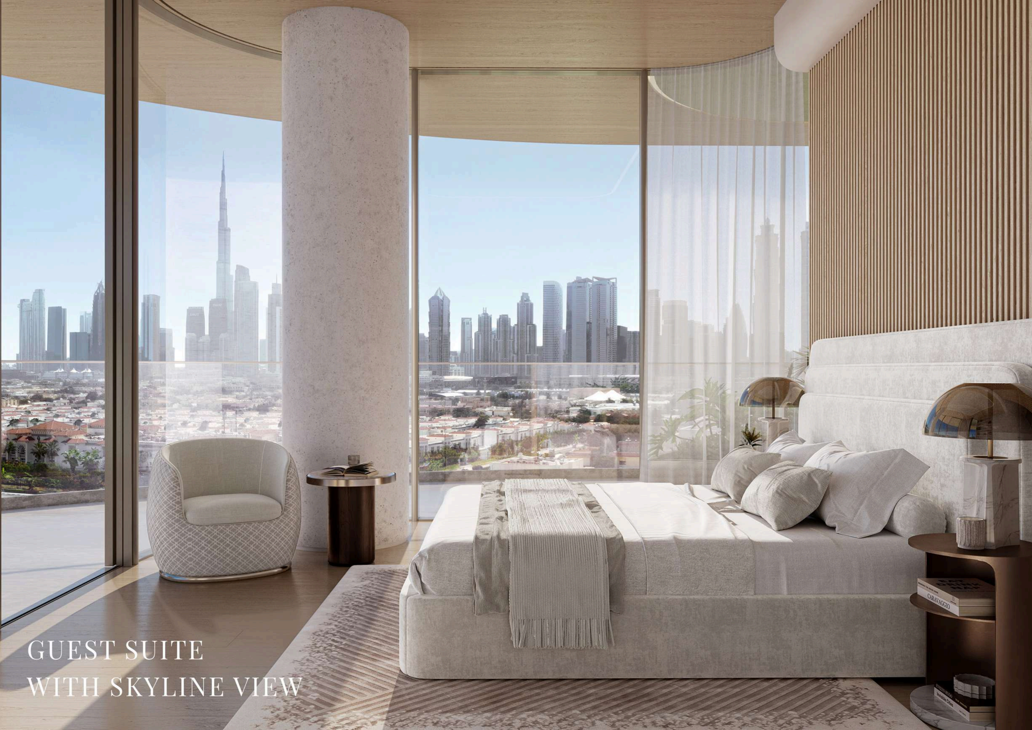
GUEST SUITE WITH SKYLINE VIEW