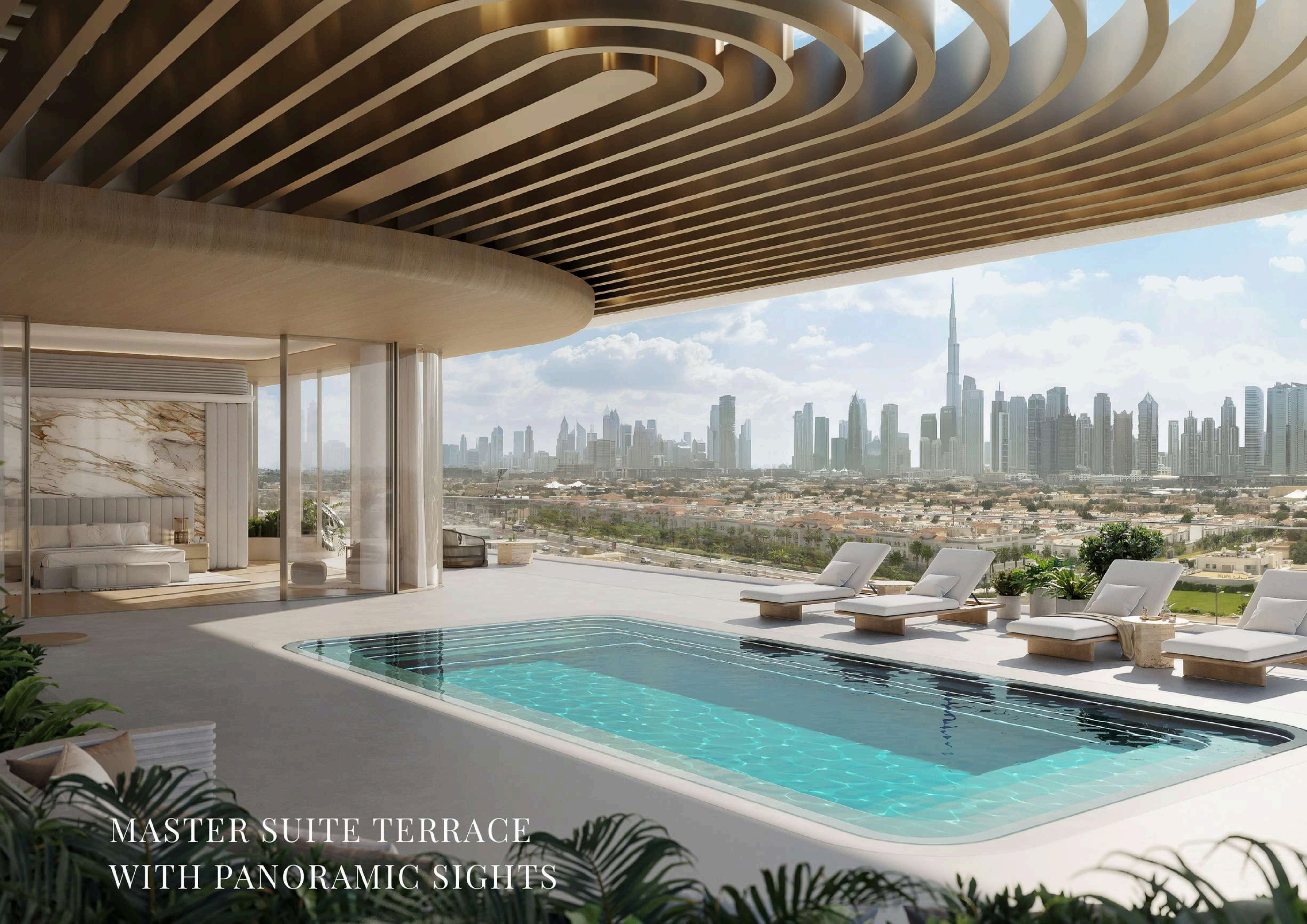
MASTER SUITE TERRACE WITH PANORAMIC SIGHTS