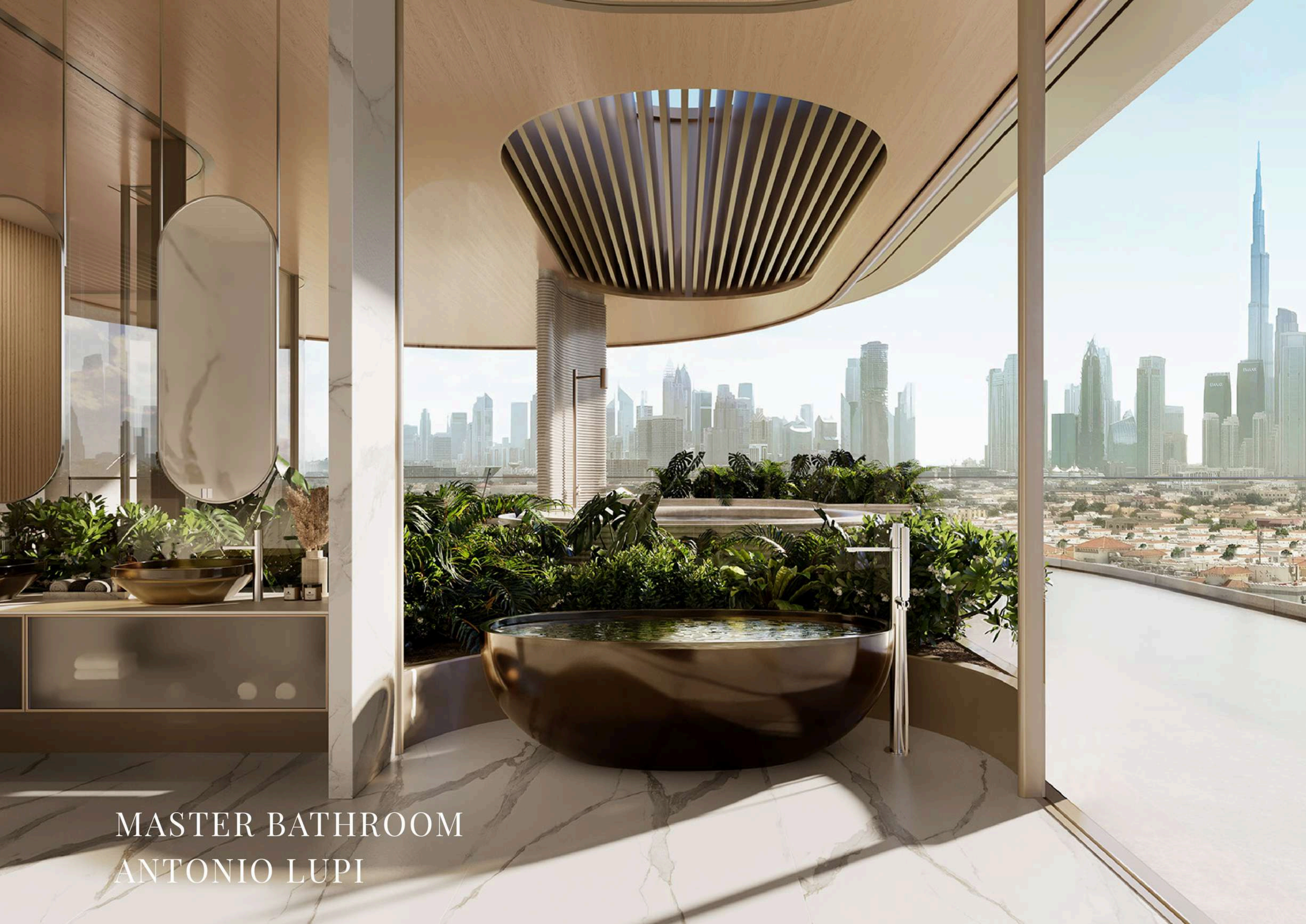
MASTER BATHROOM ANTONIO LUPI