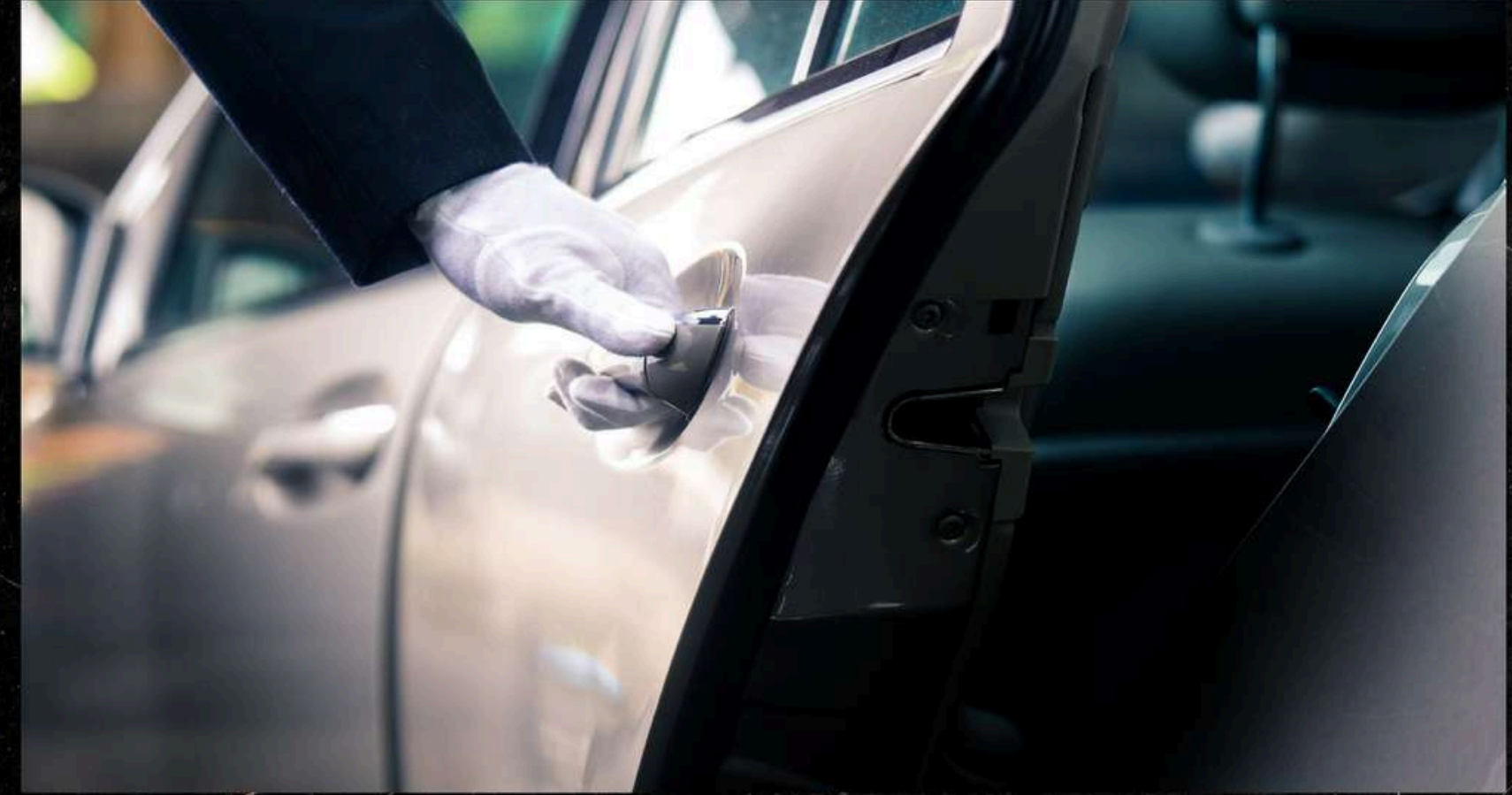
Dedicated Chauffeur Service