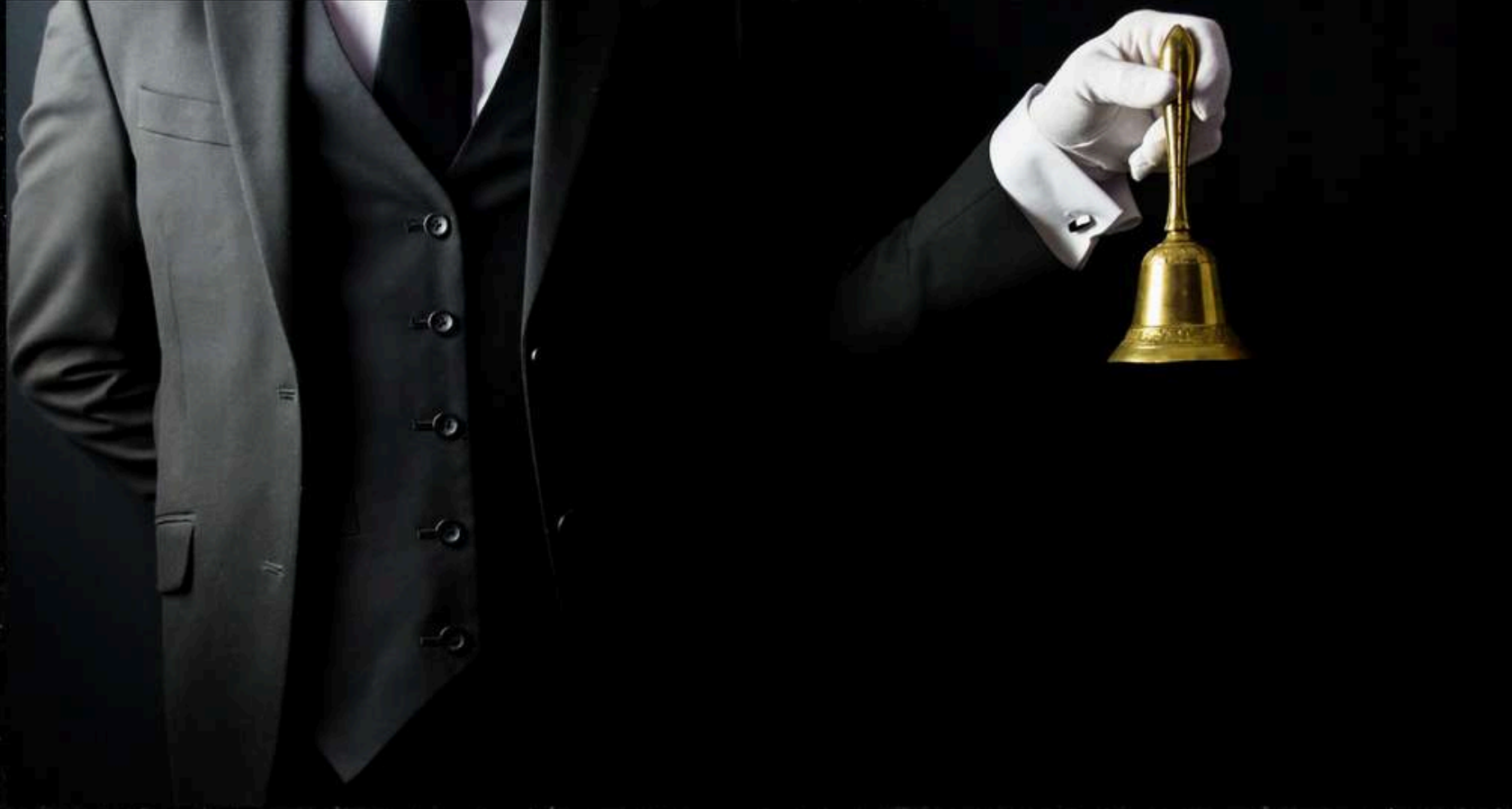
24/7 Luxury Concierge