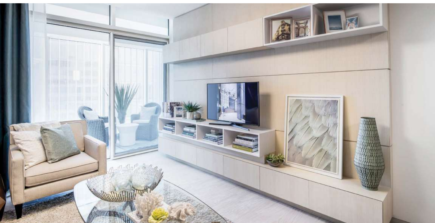
IMAGES FROM ACTUAL SHOW APARTMENT