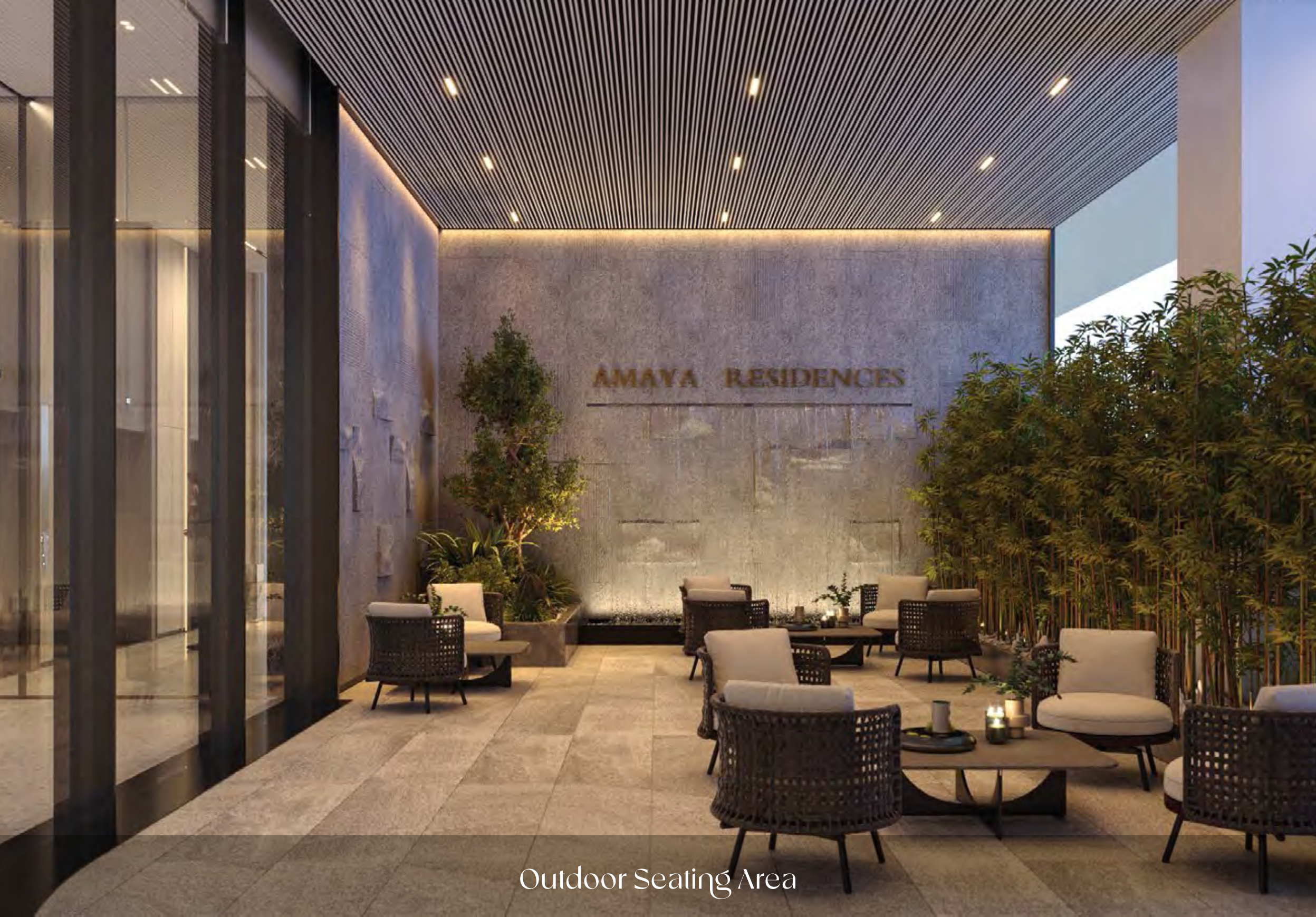
Outdoor Seating Area