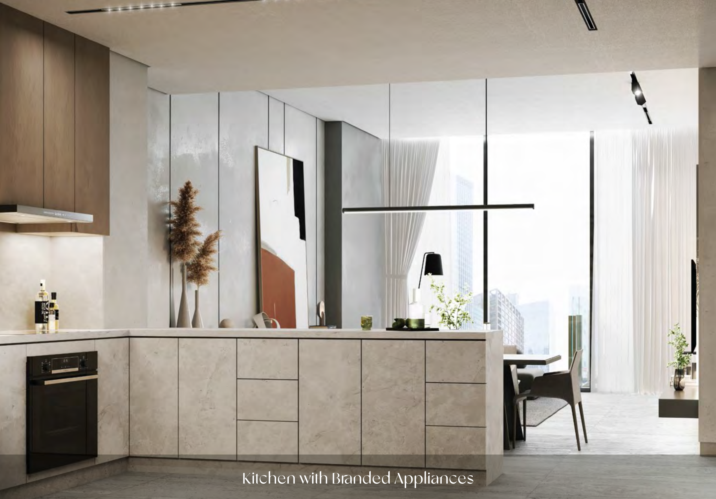
Kitchen with Branded Appliances