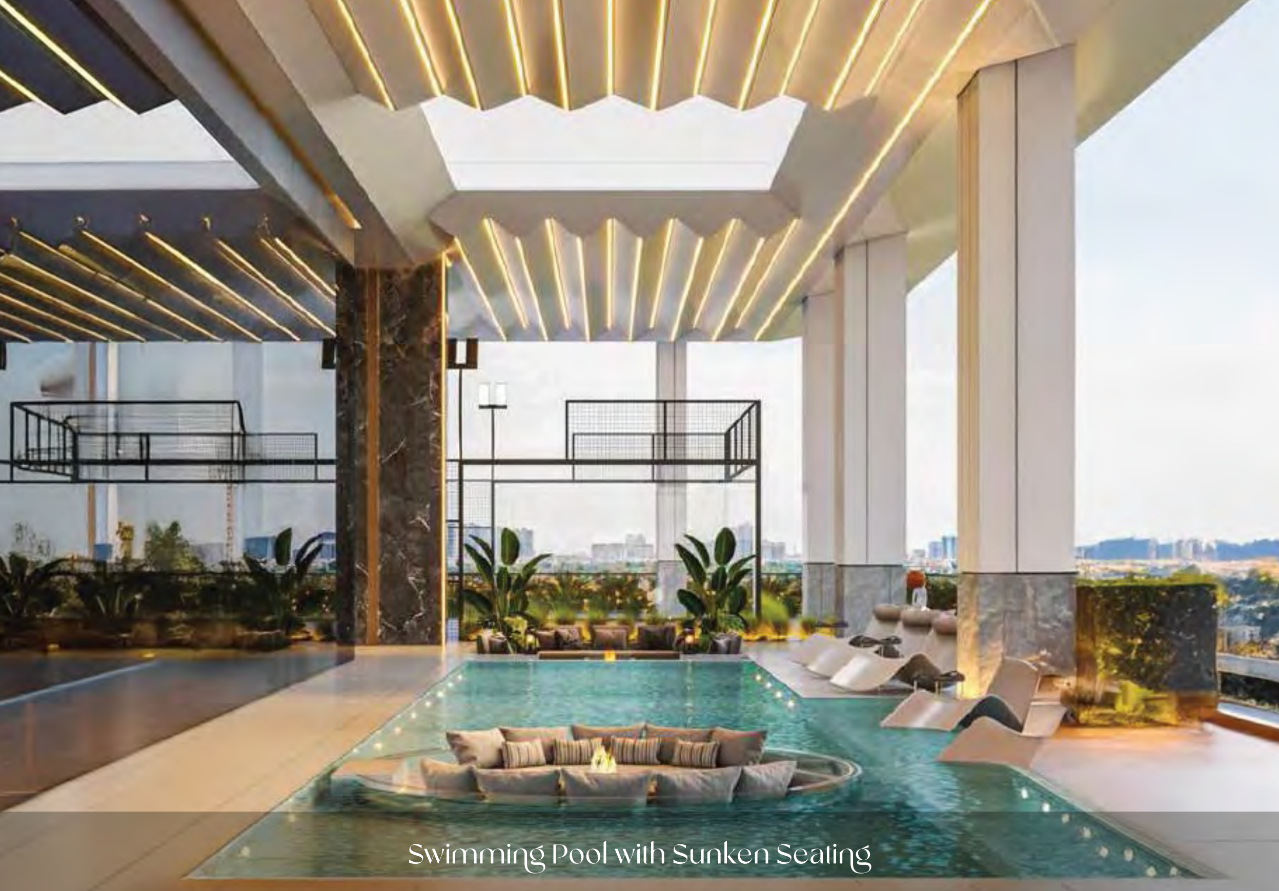
Swimming Pool with Sunken Seating