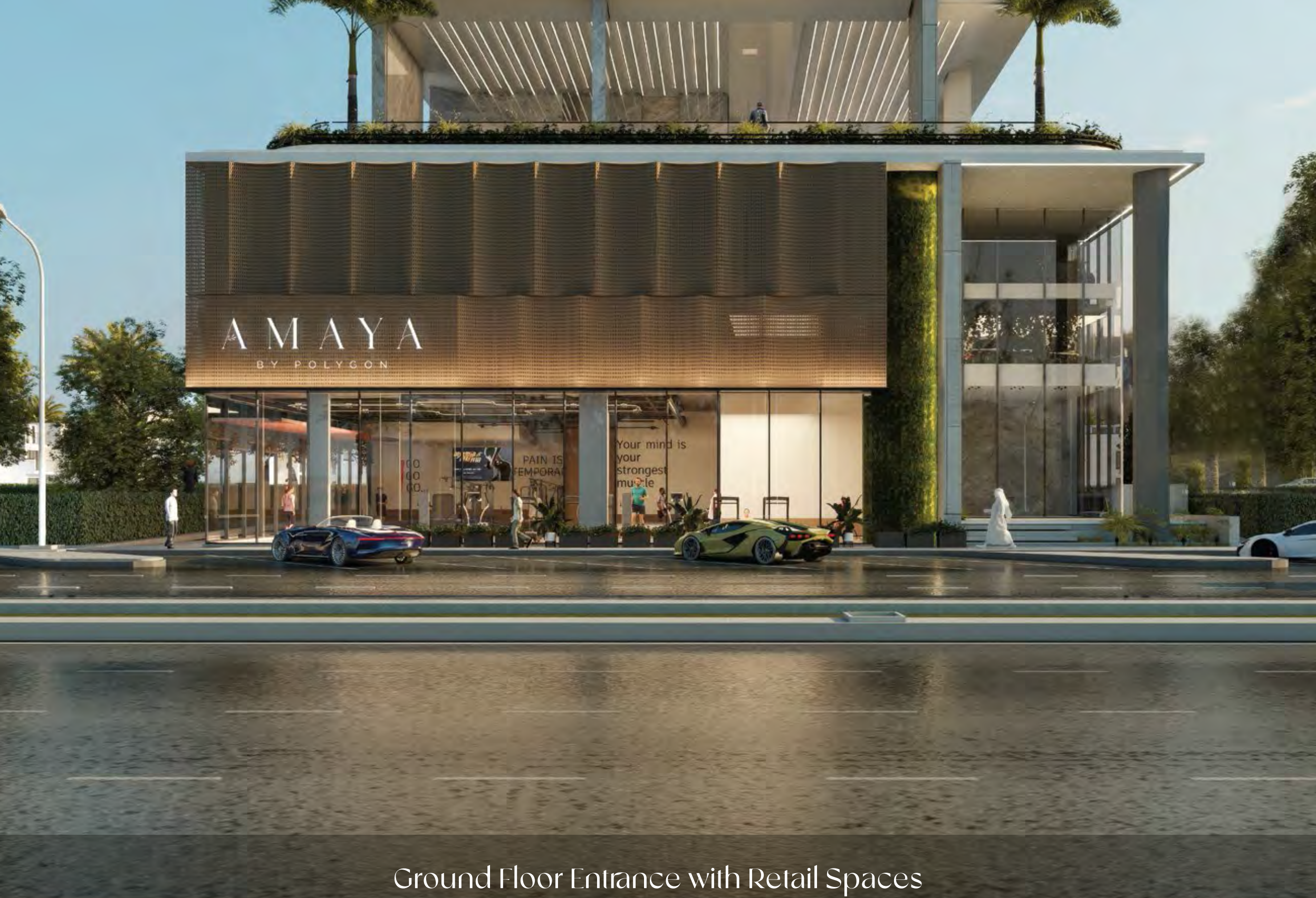
Ground Floor Entrance with Retail Spaces