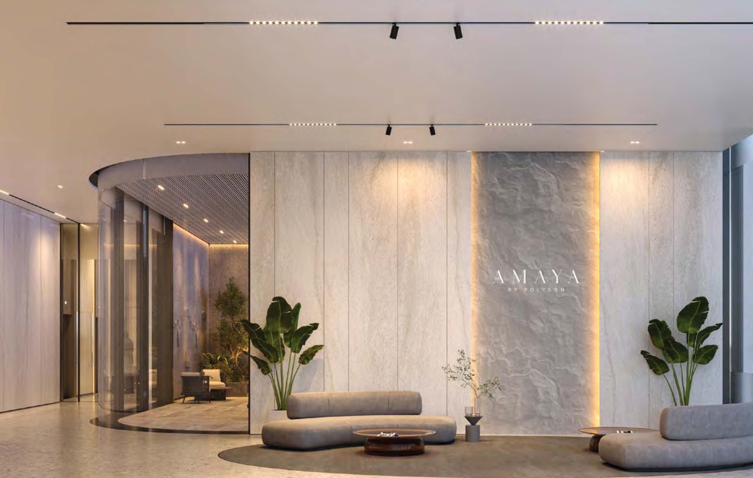
Double Height Opulent Atrium