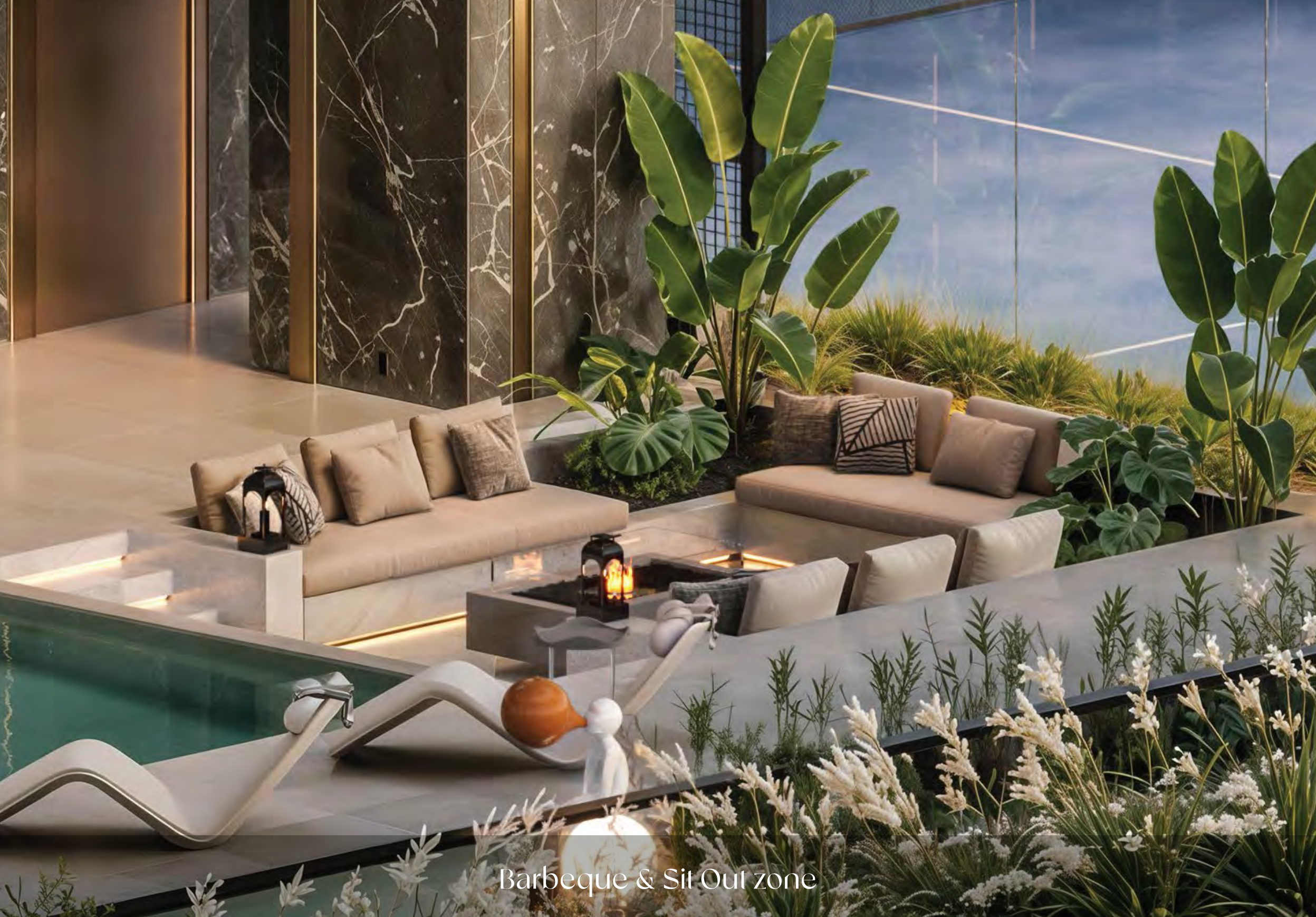
Barbeque & Sit Out zone