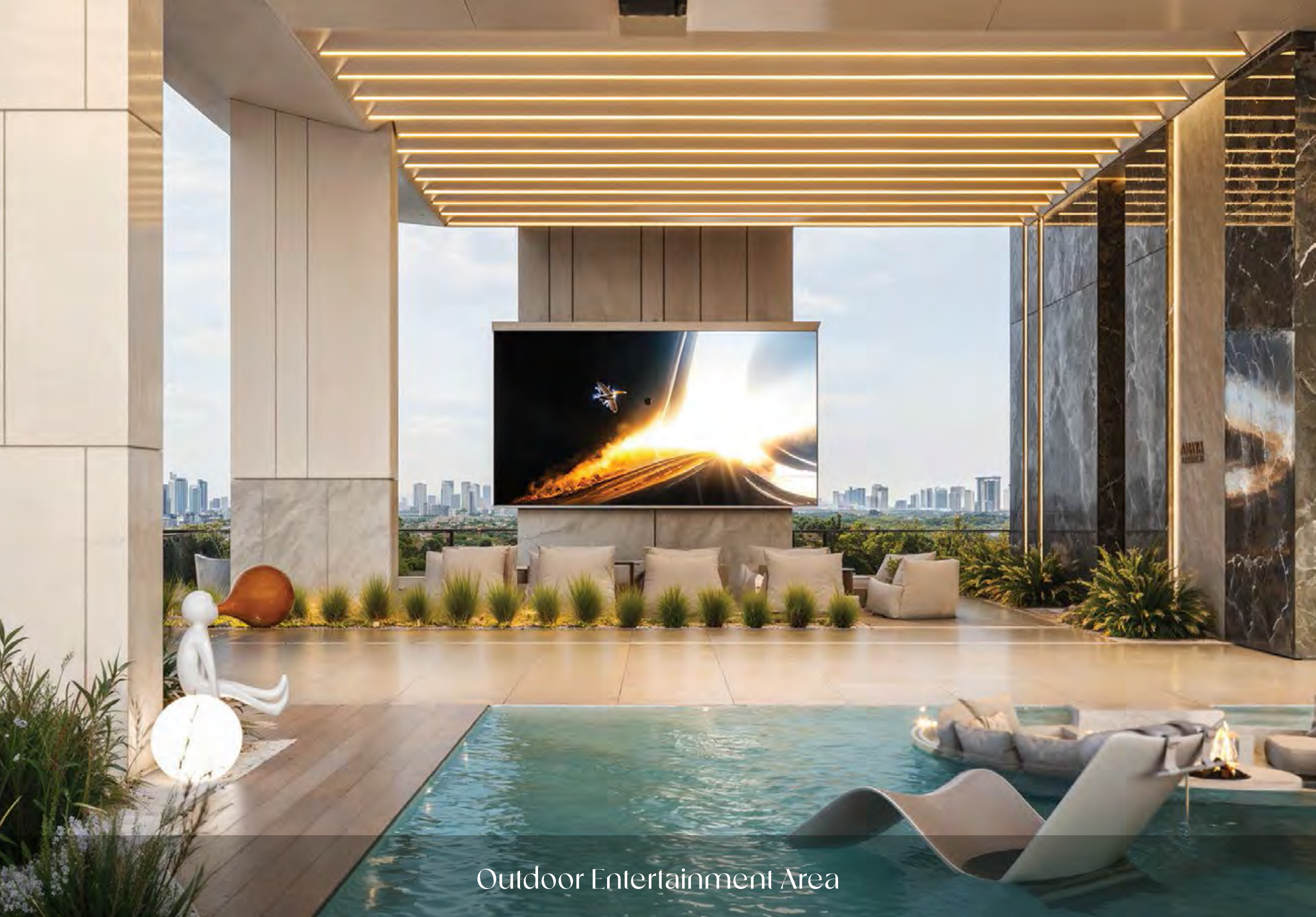
Outdoor Entertainment Area