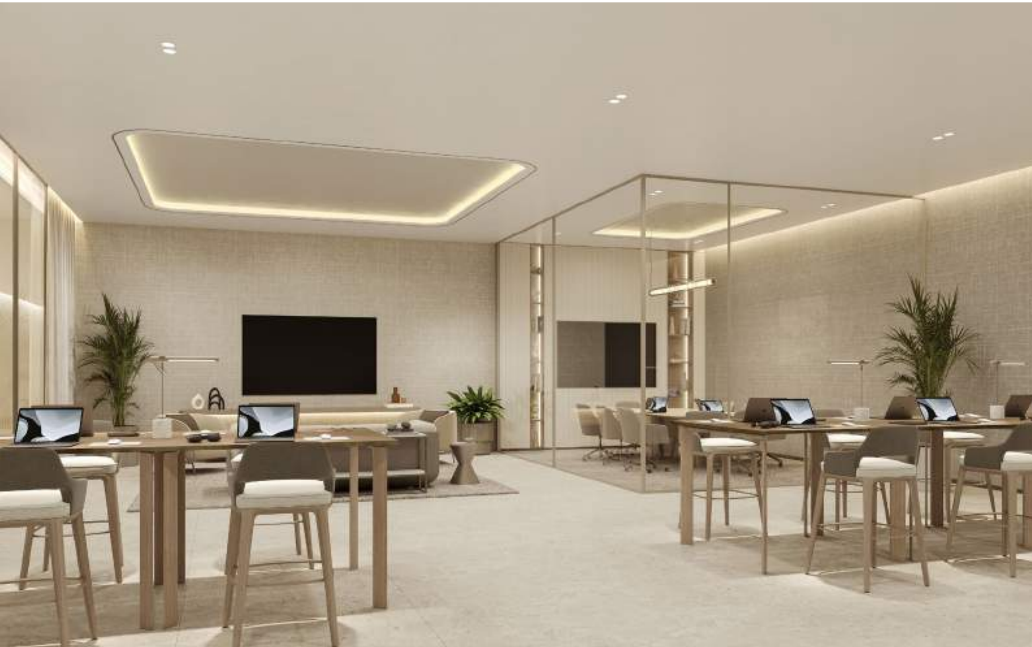
Flexible coworking spaces

Residents enjoy exclusive coworking spaces, while private offices offer a professional and refined environment, accessible through a dedicated lobby for an exclusive arrival experience.