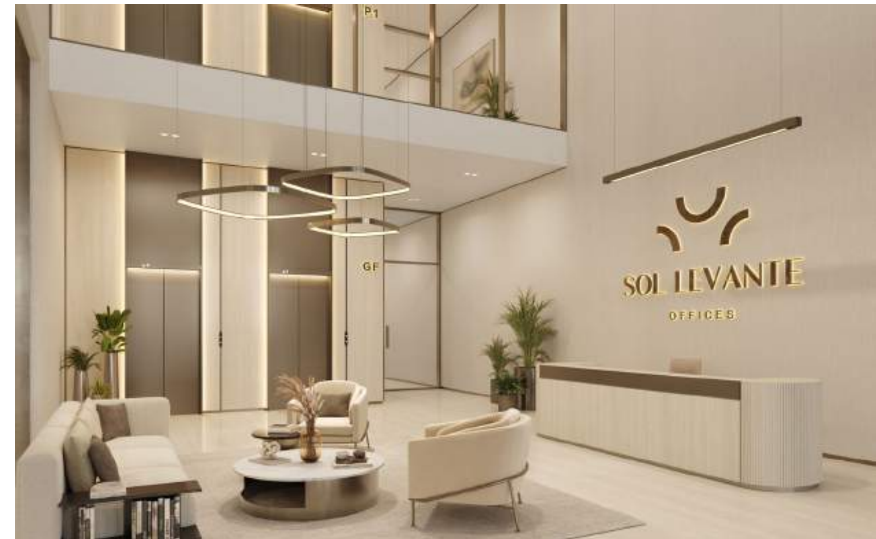
Private offices lobby