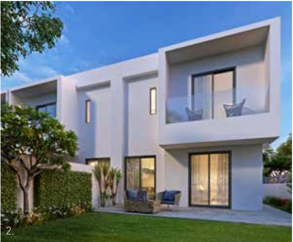
1. Master bedroom 2. Exterior rear view 3. Exterior front view