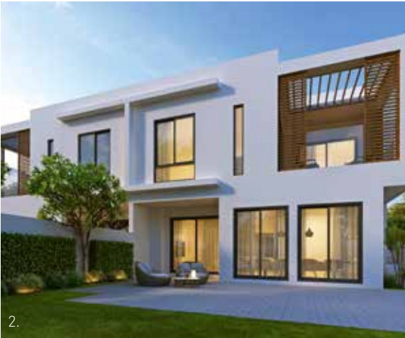
1. Living room 2. Exterior rear view 3. Exterior front view