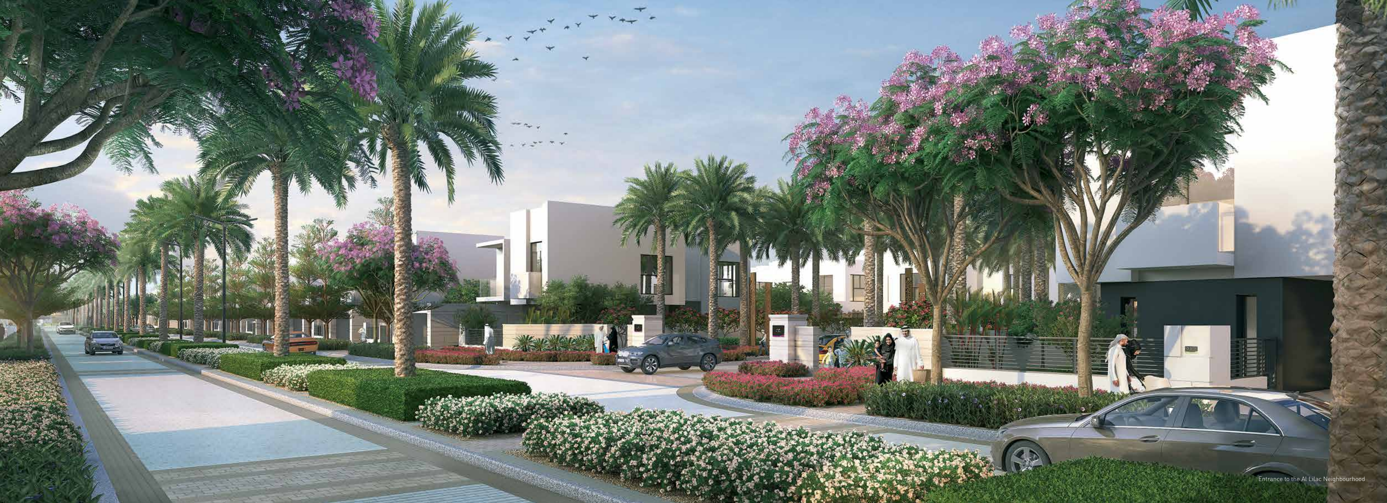
Entrance to the Al Lilac Neighbourhood