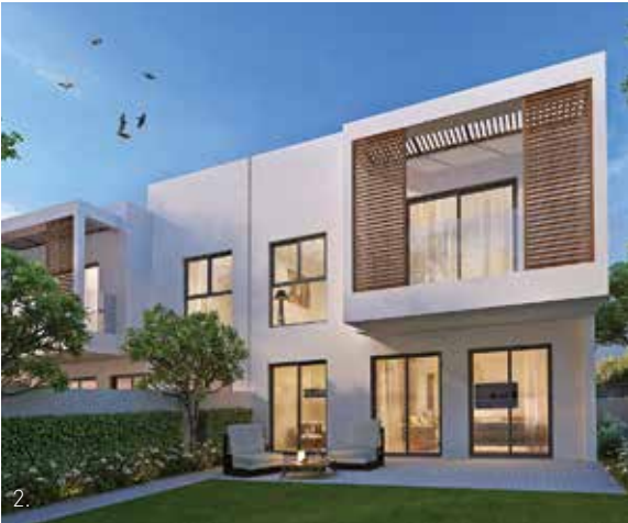
1. Living room 2. Exterior rear view 3. Exterior front view