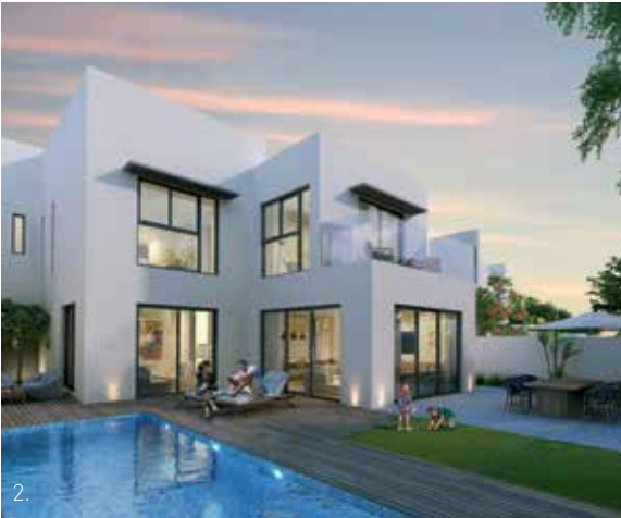
1. Family living room 2. Exterior rear view 3. Exterior front view