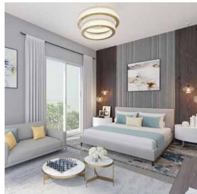
Grey Scheme 1. Dining room 2. Kitchen 3. Family bathroom 4. Master bedroom All homes are available in either the grey scheme or the beige scheme based on customer preference.