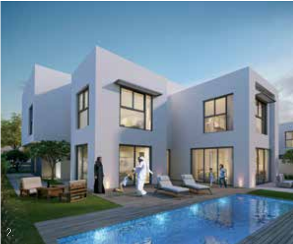
1. Master bedroom 2. Exterior rear view 3. Exterior front view