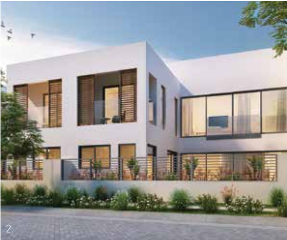
1. Family living room 2. Exterior side view 3. Exterior front view