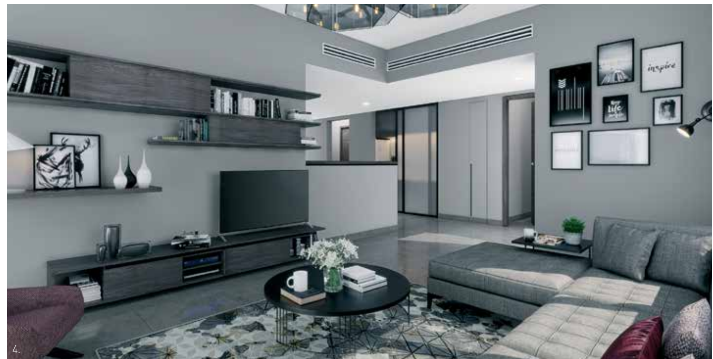
Grey Scheme 1. Living and dining room 2. Kitchen 3. Entry hallway 4. Family living room All homes are available in either the grey scheme or the beige scheme based on customer preference.