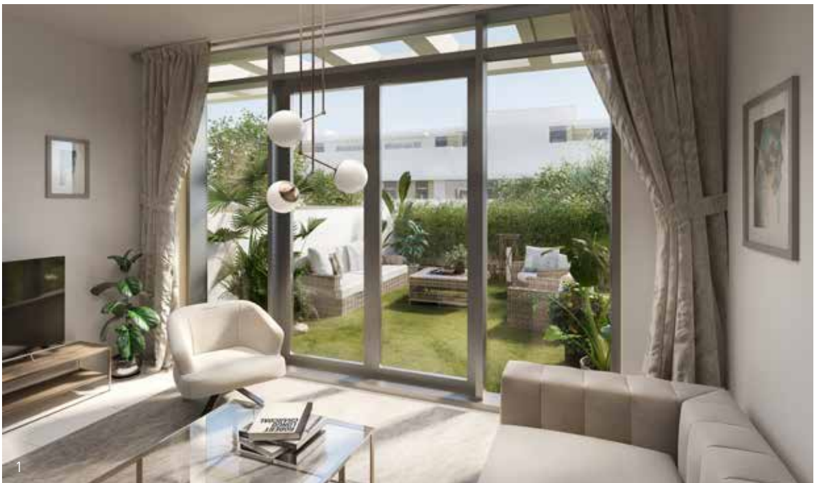
1. Living room 2. Exterior front view 3. Exterior side view

These newly introduced homes offer meticulously designed layouts perfect for small families or young professionals. As standard, these homes are available with the choice of either a private garden on the ground floor or a private terrace on the first floor.